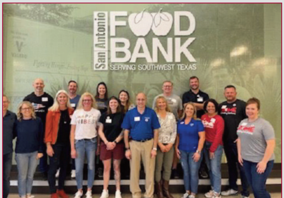
Women's Alliance PACK IT for San Antonio Food Bank