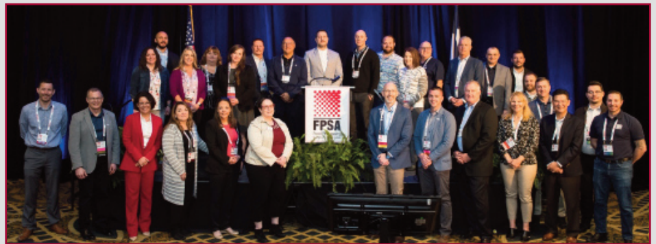
Network Meeting's Group Photo at the 2022 FPSA Annual Conference in San Antonio, Texas.