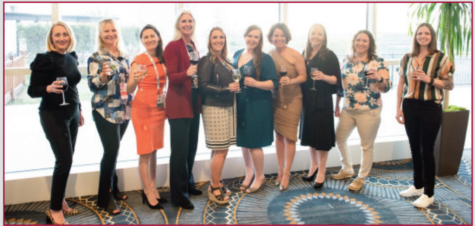
Members of the Women's Alliance at the FPWA Auction Reception during 2022 Annual Conference