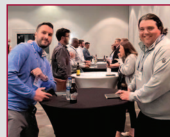
Participants during the YPG Speed Networking Reception at the FPSA Sales Conference. (Pictured above)